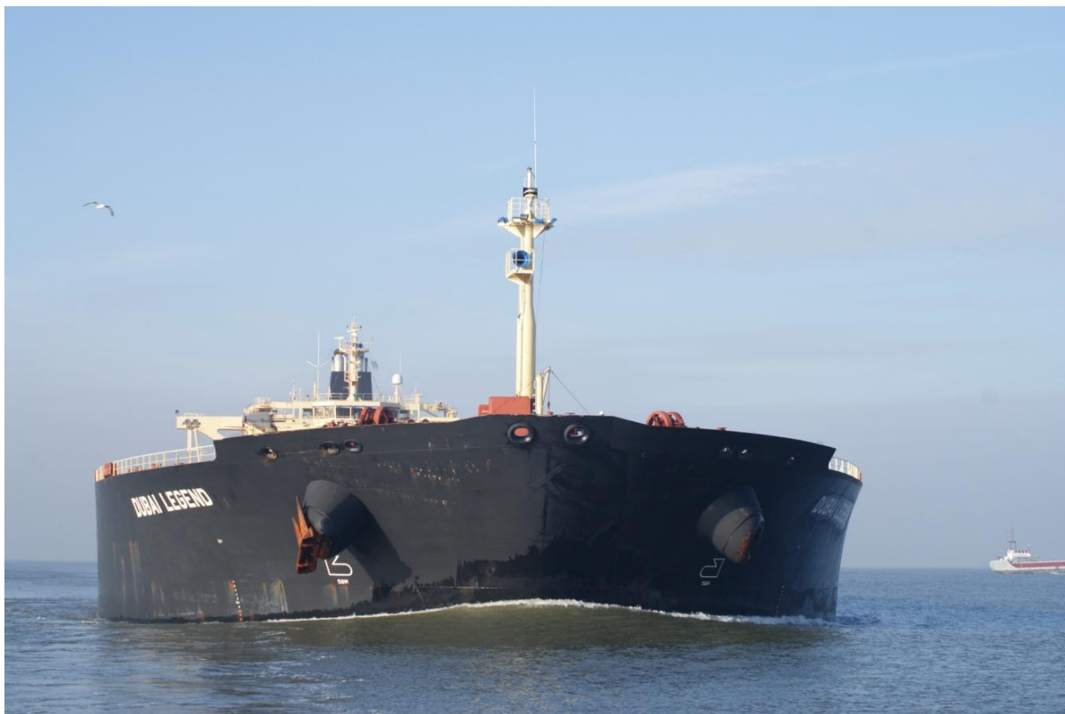
Figure 3 (Below). The high bow pressure (bow wave) can clearly be seen at the bow of the loaded bulk carrier.