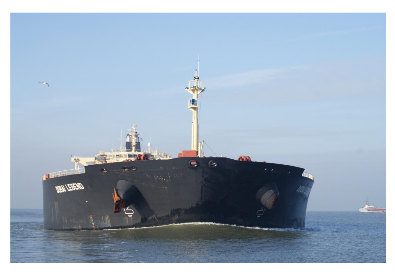
Figure 3 (Below). The high bow pressure (bow wave) can clearly be seen at the bow of the loaded bulk carrier.

Figure 2 (Left) Some approach manoeuvres of an ASD-tug when working over the bow and when over the stern. Source: `Bow tug operations with azimuth stern drive tugs' NI. Henk Hensen.